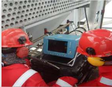
Eddy Current (ET) Inspection