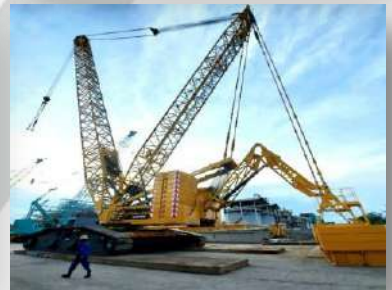
Crane Inspection and Wire Rope Testing