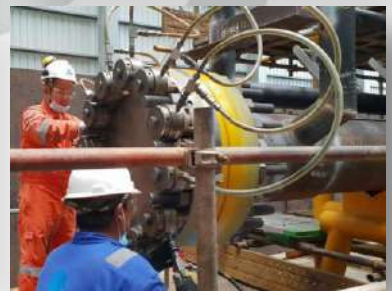
Bolt Tensioning Flange Management