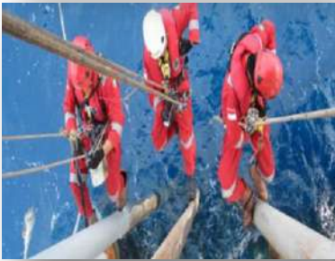
Rope Access IRATA