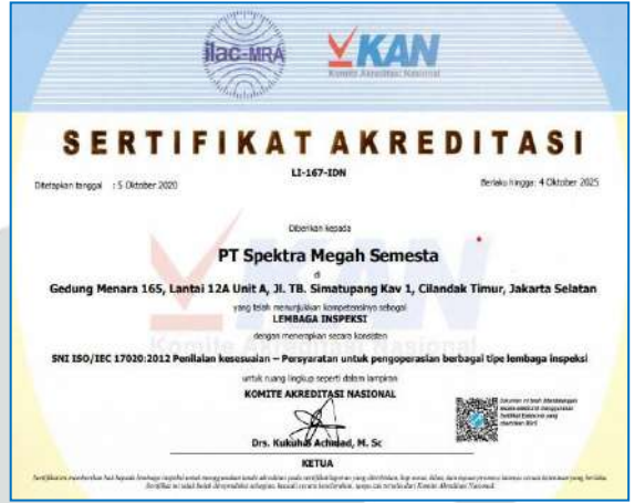
KAN 17020: 2012