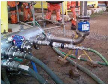
Flow Monitoring Water Calculated Flushing