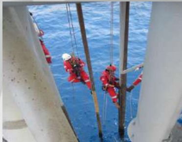
Rope Access IRATA