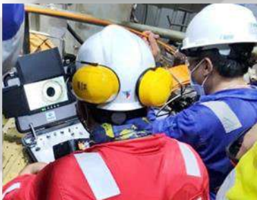
Borescope video inspection