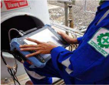
ADVANCE NDT UT Inspection