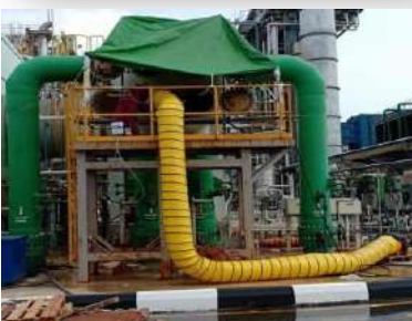
Cleaning Separator | Condenser