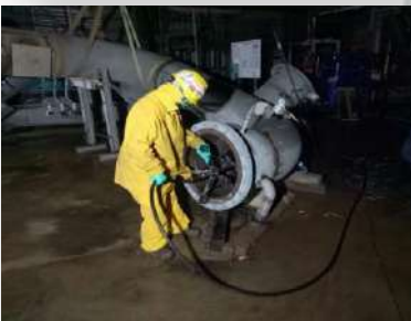
Hydro jetting Pipe Line