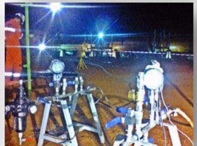
Pneumatic testing of buoyancy tank