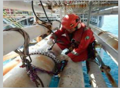
Rope Access IRATA