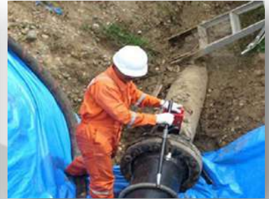
Eddy Current (ET) Inspection